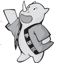
Gakkensai Character: Sai-chan

During educational and research activities... refers to times during which you are taking classes, participating in school events, etc. See below for details!