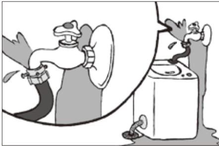
1) Joint section